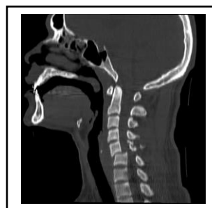
Figure 1: CT imaging showing comminuted C5 posterior element fracture with anterolisthesis of C5 over C6.

He was diagnosed with C5/C6 fracture dislocation with incomplete neurology ASIA C (American Spinal Injury Association). Spinal cord decompression and posterior instrumentation with fusion from C3 to C7 was done within 12 hours from time of injury. At post-operative day 5 he regained almost normal power to his bilateral upper limb and right lower limb with some residual weakness on left lower limb (L2-S1).