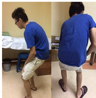
Figure B shows the abnormal posture of the patient upon presentation to the clinic.