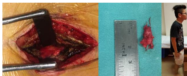
Figure C shows intra-operative figure and the removed nucleus pulposus and the patient recover with normal posture after the surgery.