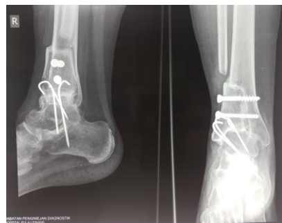
Figure 2: Post op 1 year x-ray shows bone union