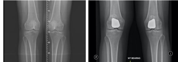
Figure 2 showing the anterior posterior x-ray of a patient with PFA with the left showing before and right showing post-surgery

Table 1 summarizes patient demographics and outcome scoring.