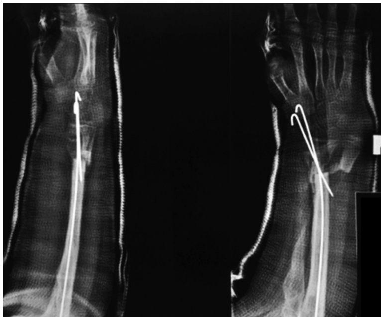
Fig. 2: Immediate post-operative radiographs of the patient.