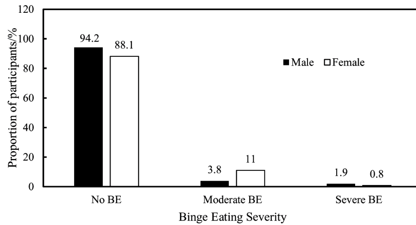
FIGURE 1. Binge eating severity in males and females participants ( n = 170 ) (BE = binge eating; p > 0.05 Chi-Square Tests)