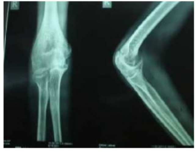
Figure 1: Pre-operative radiograph of a 32 years old male presented with post traumatic stiff right elbow (Group II) of 30° to 80° ROM. Note extra-articular bony block with maintenance of articular congruity.

The patients were operated under brachial block anesthesia in supine position under tourniquet control. The patients having the pathology confined to either lateral or medial part of joint was operated primarily using either lateral or medial approach respectively. But in the majority the contracture was so marked that combined medial followed by lateral approach or