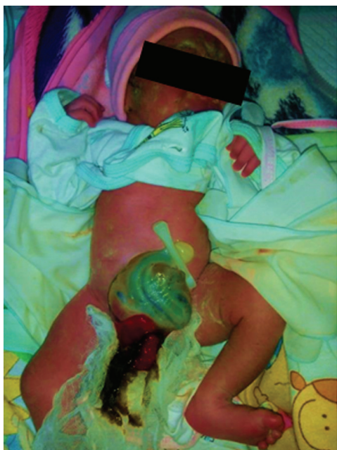
Figure 1: The patient's condition when he first arrives in the emergency room Soebandi Hospital. There was an omphalocele with meconium (and urine) discharged out from the defect.