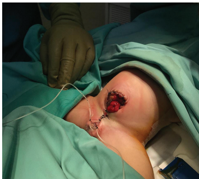
Figure 4: Post-operative condition

hours, Metronidazole 14 mg/8 hours, Paracetamol 25 mg/8 hours, monitoring fluid and electrolytes) and take oral breast milk gradually. The result was good. There was no postoperative complication. On the 6th day postoperative, patients could be transferred to the perinatology room and the intake gradually increased. At the 10th day, the patient condition was good and has an adequate intake so patient could take home medication. One month later, the patient condition was good, good function of ileostomy, no postoperative complication and the baby weight was increased.