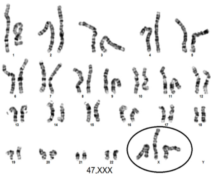
Figure 2 : Case 2 karyotyping showed an extra X chromosome