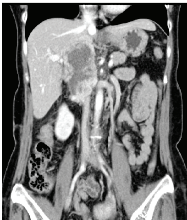
Fig. 1 Heterogenous enhancing retroperitoneal mass with central necrosis extending from the level of caudate lobe to right renal hilum (arrow). No clear plane can be appreciated with the liver cranially as well as right renal artery and vein caudally.

Macroscopically, the tumour was described as Kieffer stage 2 (located between the renal veins and hepatic veins). The tumour size was 7 cm AP diameter x 6 cm width x 9 cm height craniocaudally and has no plane of demarcation with right kidney and adrenal gland. Cut section of the tumour show fleshy, yellowish tan mass with minimal areas of cystic change filled with blood. The inner vascular surface is smooth.