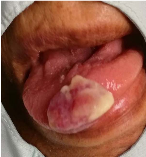
Fig. 1 Tip of tongue mass at the initial presentation which appeared one year after nephrectomy.