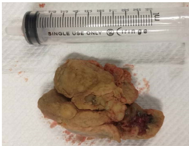
Fig. 3 Metastatic tumour mass which was excised with 1 cm margin.