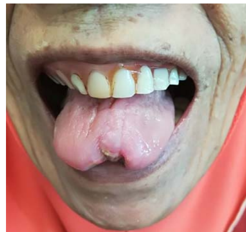
Fig. 4 The healed operated site as seen after 2 months post-surgery.