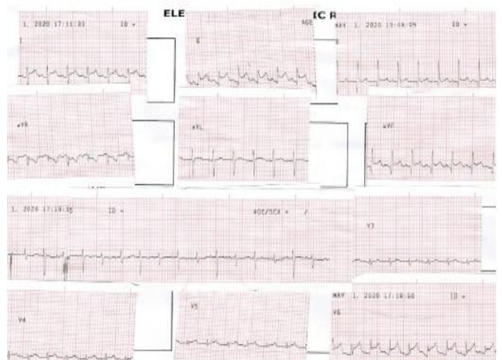
Figure 2: Electrocardiographic changes consistent with pericarditis and pleural effusion in the patient; sinus tachycardia, diffuse concave ST elevation in the lateral and inferior leads; PR depression; alternate beat amplitude of the QRS complex (Electrical Alternans) indicative of pericardial effusion; Low QRS voltage in the precordial leads.