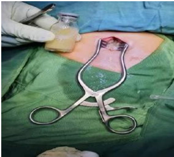
Figure 4: Drainage of a grossly purulent pericardial fluid after pericardiostomy, a JP-tube was placed in the pericardial space for continuous drainage.

Gram stain of the pericardial fluid showed moderate number of gram-positive cocci singly and in clusters and the presence of many wbc/mm 3 comprising mostly (82%) of neutrophils, while the pericardial tissue sample demonstrated marked acute and chronic inflammation. Cultures from the pericardial fluid and blood specimens grew methicillin-resistant Staphylococcus aureus (MRSA) sensitive to clindamycin, vancomycin, and linezolid. A total of 217 cc of purulent fluid continued to be evacuated from the pericardial drain in the ensuing hospital days. On the 3 rd day of admission, cardiac and respiratory rates were down to acceptable limits. A repeat chest x-ray showed a reduction in CT ratio (Fig. 1B), and the electrocardiographic reading was normal; however, the patient remained to have intermittent febrile episodes with temperature of 38-38.6°C. The patient was then referred to the infectious disease service that advised antibiotics be shifted to vancomycin (60 mg/kg/day q6 hours) monotherapy. 9