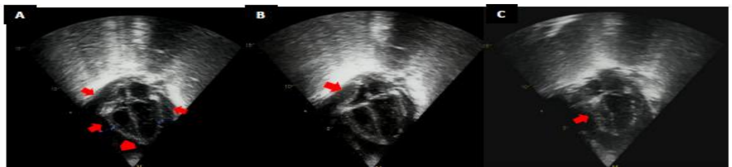
Figure 3: Four chamber view of the patient’s echocardiography and tamponade physiology. A. Moderate circumferential pericardial effusion (Red arrows). Left ventricle side: 1.52 cm, Right ventricle side: 1.1 cm, Right atrial side: 1 cm. The red arrow in B is pointed to a collapse right atrium, while the arrow in C is focused on a collapse right ventricle.